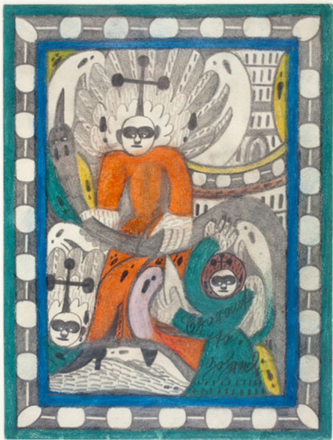
Adolf Wölfli.